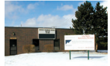
The owners of Kulis Automotive on East Avenue in Mentor worked with MEACO to successfully obtain an SBA 504 loan.

Marshfield Group has grown steadily since its inception in 1979. As one of the area's largest and fastest-growing marketing communications agencies and consultancies, we bring award-winning marketing strategies, graphic design, public relations, web site design and development, multimedia, trade show management and more to companies of all sizes in many different markets. Marshfield Group was named to the Lake-Geauga Fast Track 50 for 2000 and 2001 and to Case Western Reserve University's Weatherhead School of Management's 100 Outstanding Growth Companies for 2001.